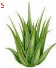
Aloe Vera Plant .

Applied topically, Aloe Vera Gelly is very effective for all types of skin problems and is particularly beneficial in the treatment of bites/stings and minor burns . Aloe Vera Gelly is a clear, thick gel containing humectants and moisturisers, excellent rubbing compounds for getting pure, stabilised Aloe Vera Gelly into the skin – it is almost like applying the gel directly from the leaf. The translucent gelly is quickly absorbed and is wonderfully cooling and soothing; it can quickly and effectively, relieve itching, swelling, pain, inflammation and s